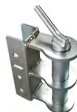
DROP PIN Ø38 MM