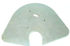
8 KG BALLASTS