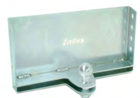
TOWBALL TRAILER HITCH