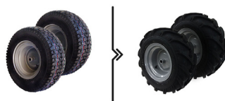
TRACTOR WHEELS (2 WHEELS)