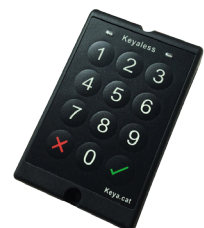
KEY PAD ON/OFF