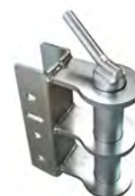
DROP PIN Ø38 MM