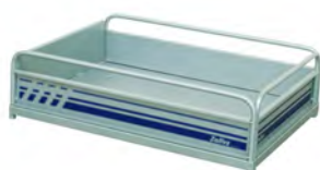
PLATFORM 750X1020XH230 MM