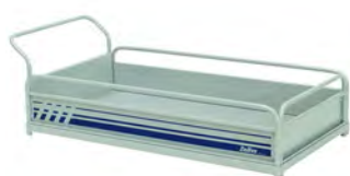
PLATFORM 695X1250XH230 MM