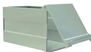
PLATFORM 700 L