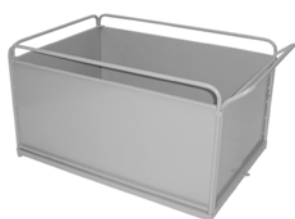
PLATFORM 800X1250XH630 MM