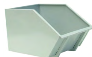
PAINTED SKIP 500 L