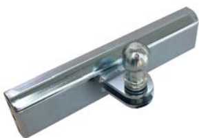
TOWBALL TRAILER HITCH